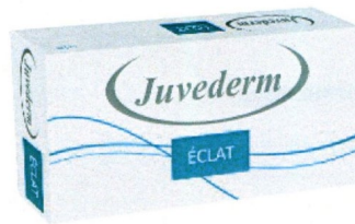
Juvederm ÉCLAT Whitening cocktail

15. The Opponent states that after successful development and sales in the MENA region (Middle East and North Africa) from 1999 to 2006, it filed and registered the Opponent’s Mark in Lebanon on 14 March 2007. 6 Exhibit B to the HET SD includes copies of (i) Judgment of the First Instance Court in Beirut dated 23 June 2011 with English translation, and (ii) Decision of the Civil Court of Appeal in Beirut dated 29 January 2015 with English translation, relating to proceedings in Lebanon between the Opponent and Allergan in respect of, inter alia , the Opponent’s Mark. It was held by the Civil Court of Appeal in Beirut, inter alia , that the Opponent ‘was precedent [as compared with Allergan] in using the trademarks subject of the litigation as well as precedent in registering 7 them before the competent authorities in Lebanon ’ ( emphasis added ).