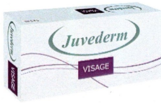
Juvederm VISAGE Anti-aging and lifting mixture

14. Exhibit A to the HET SD also includes printouts showing images of various skin care products of the Opponent with description. The printouts are undated. Images of two such products are reproduced below: