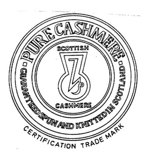
Registration No. 1987C3330