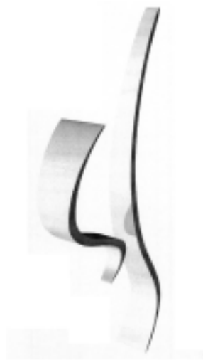
修身堂医学美容中心